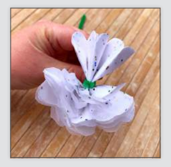
Step 7 Turn the flower around and repeat step six until the whole flower is done.