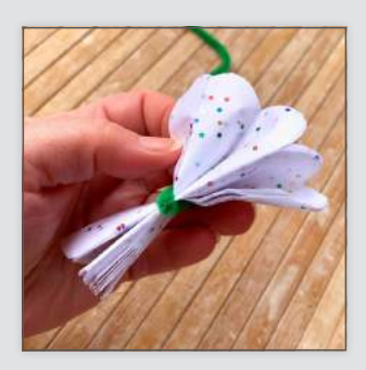
Step 5 Fan out one side of your flower.