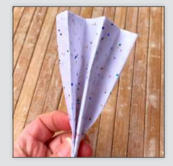
Step 2 Continue pleating the paper until you have folded the whole square.

Take 6 to 8 squares of tissue paper and layer them on top of each other neatly. Fold over a small section of the paper and then turn the pile over and make another fold the same size as the first as if you are making a fan.