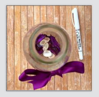
Step 13 Place your glass beads, shells or potpourri inside the bottle or jar.