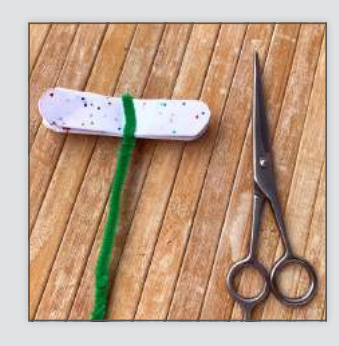
Step 4 Use your scissors to round the two edges of your folded paper.

Take a pipe cleaner and wrap one end around the centre of your folded paper, twist the two bits of pipe cleaner together to secure them.